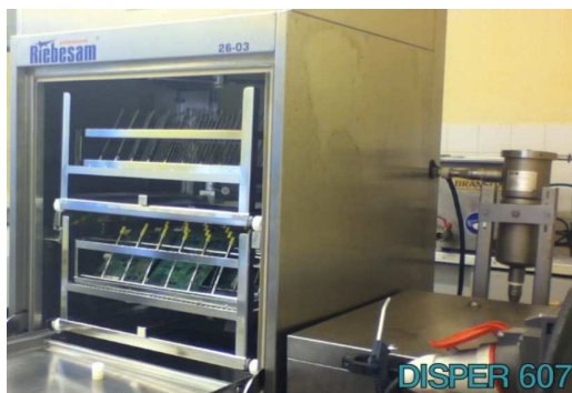
Cleaning equipment parts are not wear-out by the use of this solution.